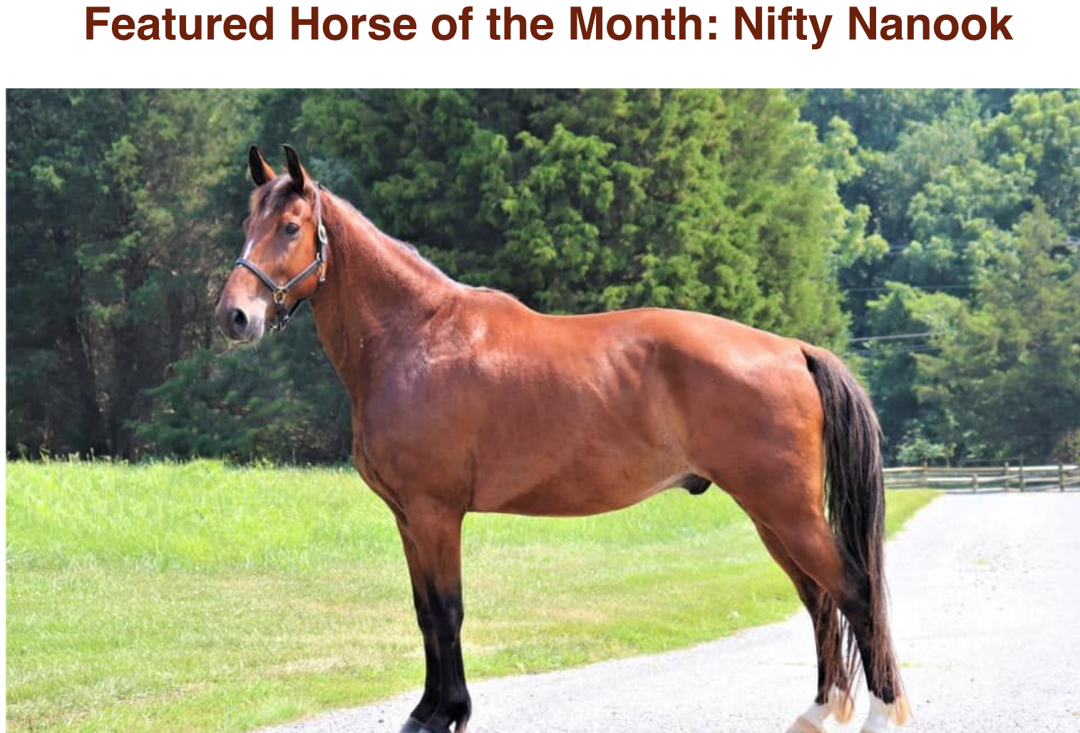
Eight-year-old Hanoverian gelding, 15.2hh

Nifty Nanook is a handsome young warmblood gelding that is sure to add some humor to your herd. While he does have some conformational abnormalities that make him unsuitable for riding, he's a sociable gentleman that enjoys hanging out with people and horses alike. He's a total ham of the group and loves to play every chance he gets!